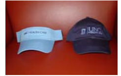
Visors and Hats