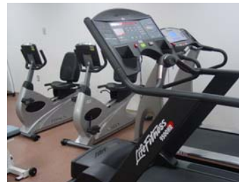
Neuroscience Weight Room

1st Floor by Accounts Payable Monday - Friday, 7:00am - 9:00pm