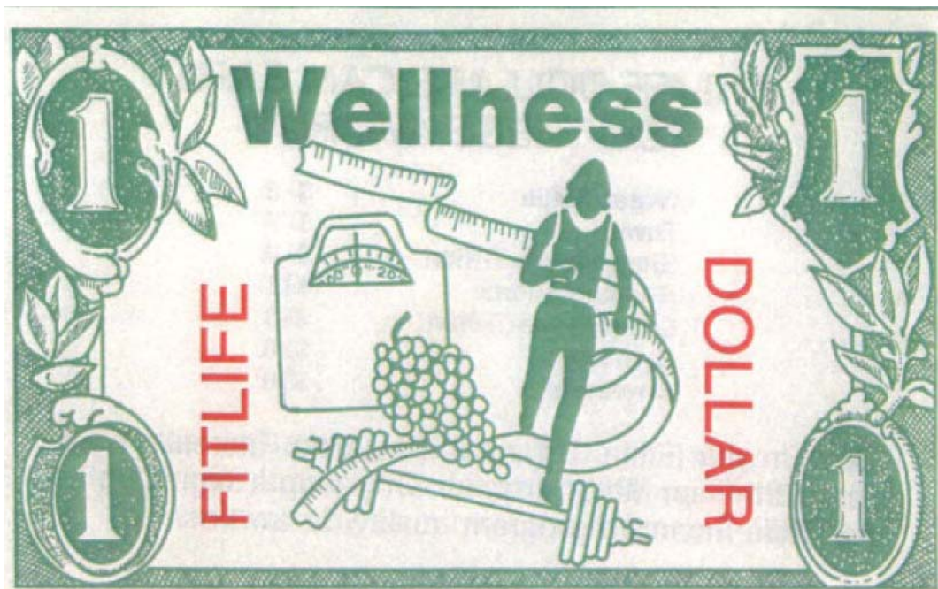
Actual Size - 3.5 x 5.5 inches

Submit your entries to our office by June 29, 2012 at 4:00 p.m. The winner will be announced in our August Newsletter