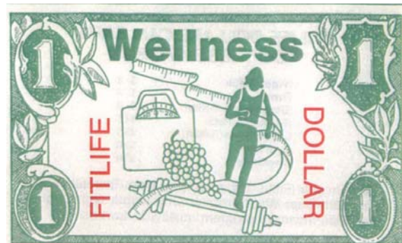
Current FitLife Dollar

We are seeking a new design for our FitLife Dollars. Submit your entries to our office by June 29, 2012 at 4:00 p.m. The winner will be announced in our August Newsletter.