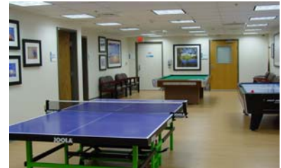
Recreation Room, Located outside Employee Recreation & Wellness' office on the 9th floor of Memorial Hospital

From Home: www.unhealthcare.org Human Resources