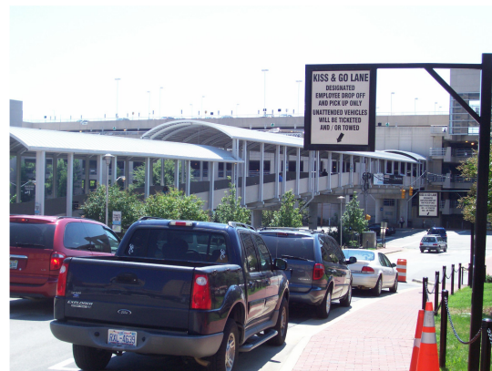
Above: Kiss & Go Lane at N.C. Memorial Exit.