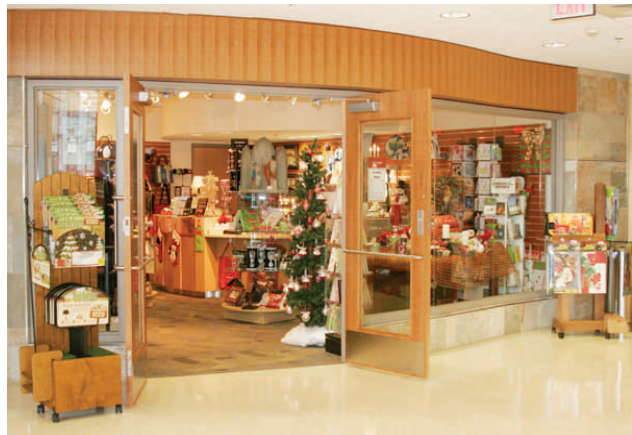
The Butterfly Boutique is decorated for the holidays and has that special gift for that special person on your list .